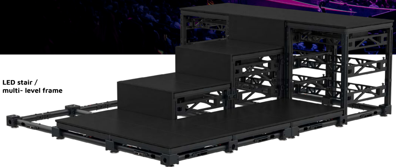
LED stair / multi-level frame