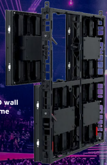
LED wall frame